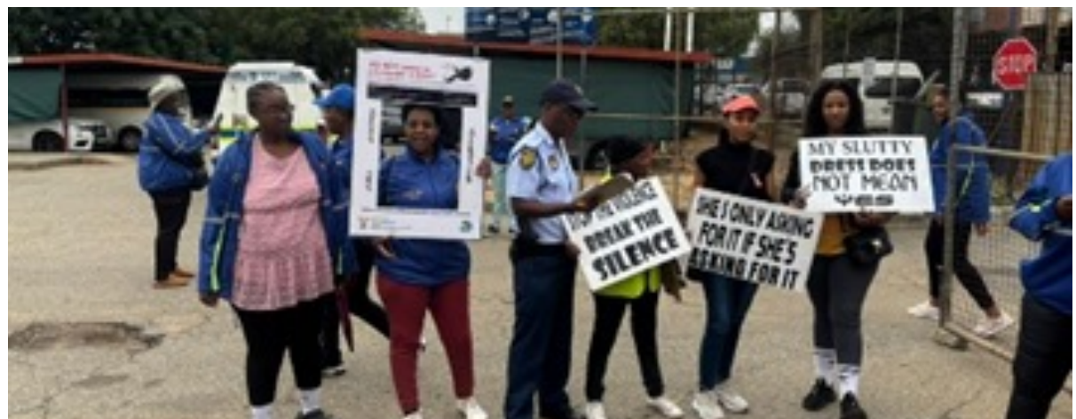
Members of the community at Tlhabane police station.