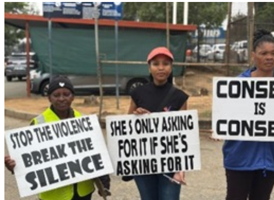
CPF and KIKENG community development organisation during the GBVF march.