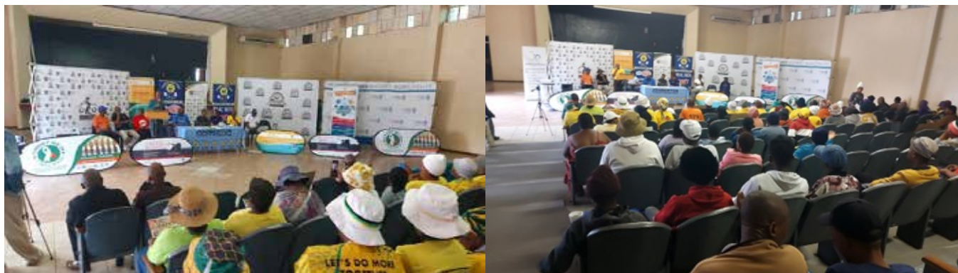
The attendants of the dialogue listening attentively to the speakers.